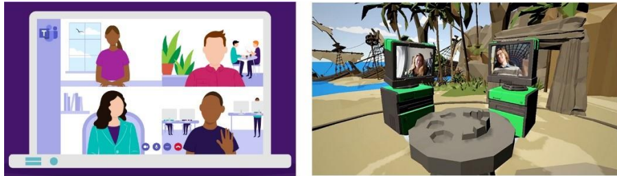
Figure 1. In MS Teams (left) users are represented in 2D in a rectangular grid layout, whereas in Mibo (right) they can walk around in a 3D world with their webcam as their head

Figure 1). To measure the convergent validity of the HSPQ, the correlation between the responses from both questionnaires and both environments was determined. To investigate the sensitivity of the HSPQ, the difference in responses between both environments was determined.