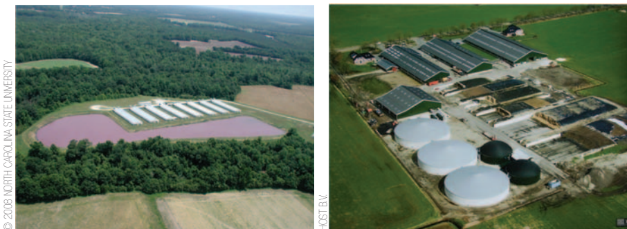
Figure 2 Commercial confined animal feeding operations adjacent to agricultural crop land in the US and Europe. a , Commercial hog production in North Carolina, United States typically uses lagoon and spray technology for manure management. b , Overview of a biomass digestion installation in the Netherlands. Here, commercial cattle producers typically use low-emission housing systems and manure digestion facilities.

eutrophication and acidification as a result of the deposition of reactive nitrogen. In addition, chemical reactions of nitrogen oxides and volatile organic compounds emitted by agricultural operations can lead to the formation of tropospheric ozone, which may adversely impact plant growth in natural and agricultural systems and affect human health and climate.