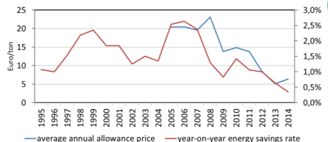
Figure 2: Emission allowance price and the energy savings rate in EU manufacturing industry