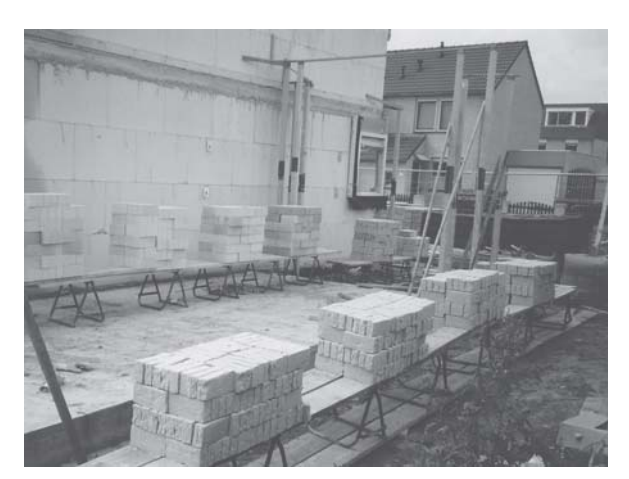
Figure 1. Raised bricklaying with stools.

At baseline, there were few differences between the intervention and control groups. The mean age of the