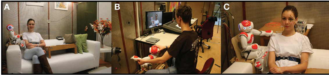
FIGURE 1 | (A) Overview of the experimental setting. (B) Manipulation of the master-robot. (C) The robot applying the touch on the shoulder. The images are intended to provide an impression of the setting; the person depicted is not an actual participant.

the interaction moments, synchronization markers were placed in the physiological recordings. For the physiological measures, the BioSemi ActiveTwo 4 system was used, in combination with flat Ag-AgCl electrodes (to measure cardiac activity), passive Nihon Kohden electrodes [Galvanic Skin Response (GSR)], and the SleepSense 1387-kit to measure respiration. Physiological data were recorded by means of Actiview software (v7.03), with a sampling rate of 2,048 Hz.