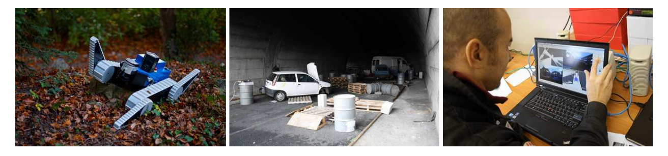
Figure 1: Left is a picture of the UGV, in the middle is a picture of the tunnel scenario on the right a participant is tele-operating the UGV.

Procedure. Participants first had to read a general instruction about the experiment and then fill out some questionnaires. After which the participant was trained to use the robot (see Figure 1). Training was first performed in line-of sight and later out of line-of-sight. When the participant was confident enough and the instructors were satisfied with their performance, they received instructions about the main evaluation. The main evaluation consisted of unit tasks (different tests of different level of abstraction) [3] and the tunnel scenario. The tunnel scenario consisted of a reconnaissance with a team: Unmanned Ground Vehicle (UGV) operator, Unmanned Aerial Vehicle (UAV) operator and the mission commander. The participant performed the role of UGV operator. The tunnel scenario took 30 - 40 minutes, the whole evaluation took 3 hours. The evaluation was between subjects, they either used the UGV without autonomy (tele-operation) or with autonomy (such as waypoint and speech navigation).