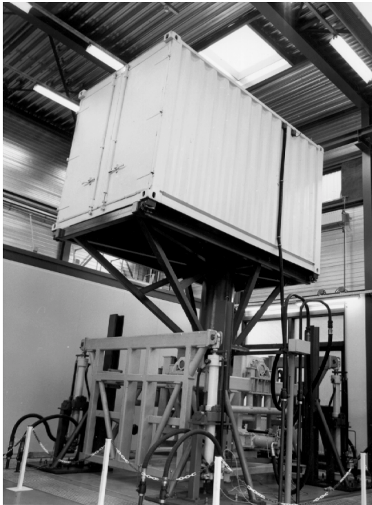
Figure 1: Ship Motion Simulator of TNO

All data were presented as a function of age group.