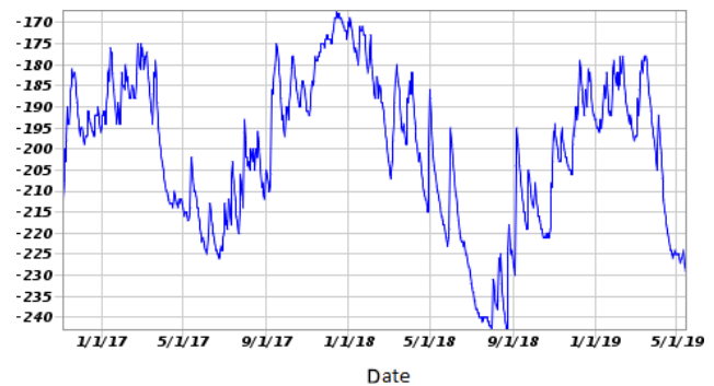
Figure 2. Example of a phreatic groundwater level monitoring well located in the peat area near Stein (TNO-GSN, 2019). The y-axis indicates elevation in cm + MSL; the surface elevation is 1.66 m – MSL. Low phreatic level during the summer of 2017 was ca. –2.25 m + MSL, whereas the phreatic level dropped during the 2018 extreme summer to –2.42 m.