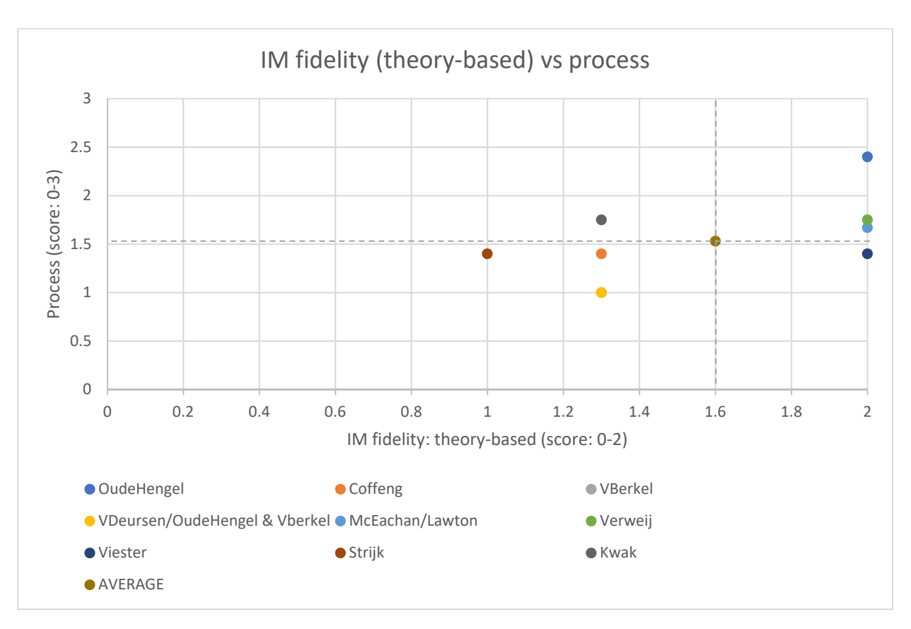
Figure 3. Scores of the fidelity of the theory-based approach (score: 0–2) and the implementation process (score: 0–3) per study (the dotted lines show the average scores for the IM fidelity (theory-based approach) and the implementation process). For three of the process evaluations, there was not enough data available to calculate a process score [25,50,54].

Comparing fidelity scores of the core IM characteristics with the implementation process and intervention effects, there only appears to be an association between the fidelity of IM activities related to the theory-based approach and the implementation process (Figure 3). A high score on the fidelity of IM activities related to the theory-based approach, appears to be associated with a high score on the implementation process. For none of the other core IM characteristics, the fidelity appears to be associated with either the implementation process or the intervention effects.