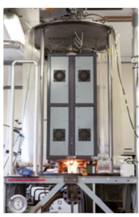
Lab-scale Combustion and gasification Simulator (LCS) for Pulverised Fuel testing.

TNO owns and operates a variety of combustion test facilities, suitable for the simulation of nearly all state-of-theart biomass combustion processes. This includes pulverized fuel, fluidized bed as well as grate-fired systems. Together with the advanced portfolio of sampling and analytical facilities, this enables widely-scoped and in-depth analyses of combustion-related problems.