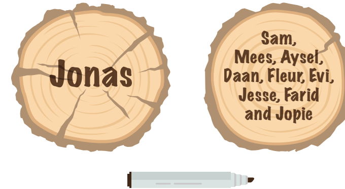
Illustration: Centering tree trunk