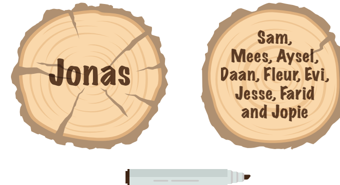
Illustration: Centering tree trunk