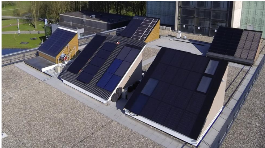
Fig. 1. Field test facility Solar BEAT. The middle dummy building in the front row contains the three types of uncovered PVT systems.

The facility was extended to be able to measure the performance of PVT and solar thermal systems in 2015. A thermal loop was designed to be able to set the input temperature and flow rate for several systems. Excess heat produced by the thermal systems is dumped in the university's aquifer. A combination of heaters, valves, chillers and control technology make sure the liquid is preconditioned to the specified temperature. The input temperature for the systems can be set between 7 and 80°C. A 25 % glycol solution is used in the PVT loop.