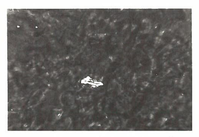
FIG. 1. Ca-oxalate crystals in dried defatted material of a luncheon meat sample containing textured soya protein; magnification 450 x.

Microscopic methods are very suitable for screening purposes. They are more specific than the chemical methods because of their showing morphological characteristics. A very rapid method used in The Netherlands takes advantage of the presence of calcium oxalate crystals in the cotyledon cells of the soybean (2,3,4). They can be seen in polarized light as polygonal green colored bodies, as shown in Figure 1. Most microscopic techniques rely on histological staining of the polysaccharide cell wall constitutents of the soy bean. Such a procedure has recently even been advocated for quantitation purposes (5) using