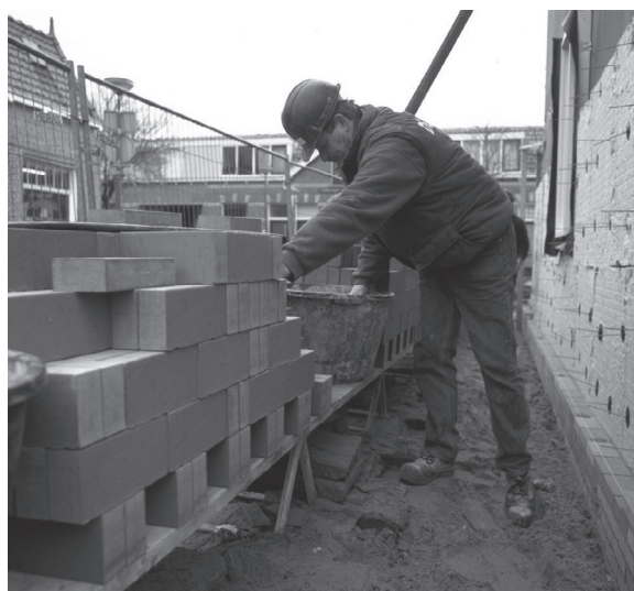
Figure 3. Trestles for adjusting the storage height of bricks and mortar.