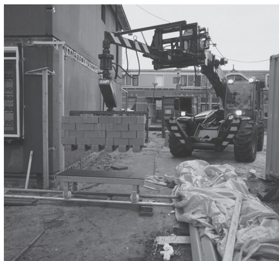
Figure 2. Mobile crane for transporting bricks.

ants work as a team. Normally, one assistant works for two to five bricklayers. The tasks between the two professions overlap. The task with the highest physical work demands is the manual transport of bricks and mortar (manual lifting and carrying materials and pushing–pulling wheelbarrows during more than 4 hours every workday) for the assistant and one-handed repetitive lifting of bricks (1 to 6 kilograms in awkward postures of the lower back during more than 4 hours per day) for the bricklayers. As an ergonomic measure, the mechanization of transport (figure 2) was selected as an intervention measure because it eliminates most of the lifting and carrying of materials. For the mechanization of bricklaying, there are no feasible solutions. Reducing awkward work postures with several devices to optimize lifting height (figure 3) was selected as an ergonomic measure.