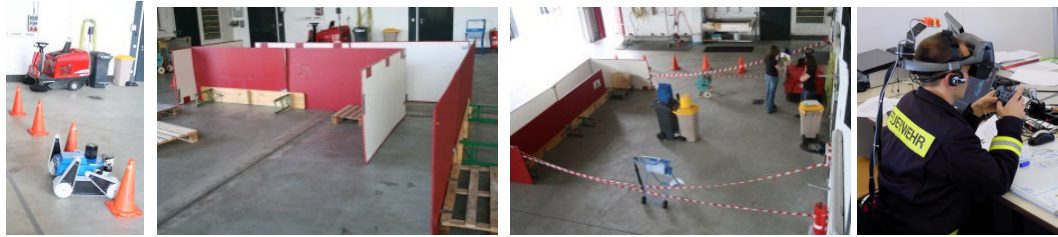
Figure 1: a) slalom task, b) narrow hallway and stop before collision task, c) detect objects task, d) operator controlling robot with game controller and head mounted display (Mioch et. al, 2012).

results of the experiment showed that the difference in collisions (SA measure) in the detect objects task explained 40% of the variance in the scenario. For performance a correlation was found between the number of collisions in the detect objects task and the scenario. Furthermore, individual differences turned out to influence performance and SA both in the unit tasks as well as in the scenario. In summary, the detect objects task is most capable of predicting SA in the scenario. However, individual characteristics may not be ignored.