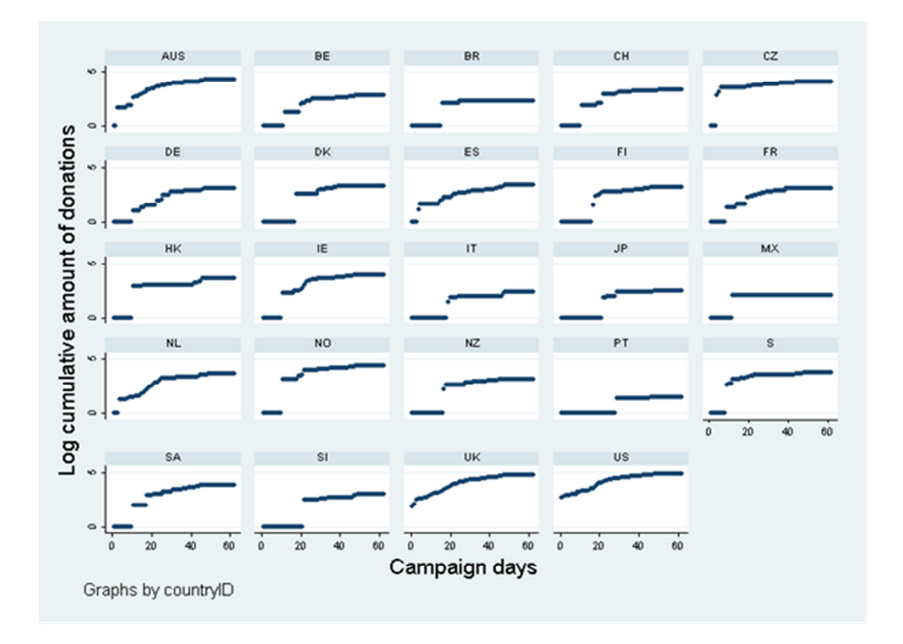
Figure 2: The growth curves of donations during the 2013 Movember Campaign in 24 countries