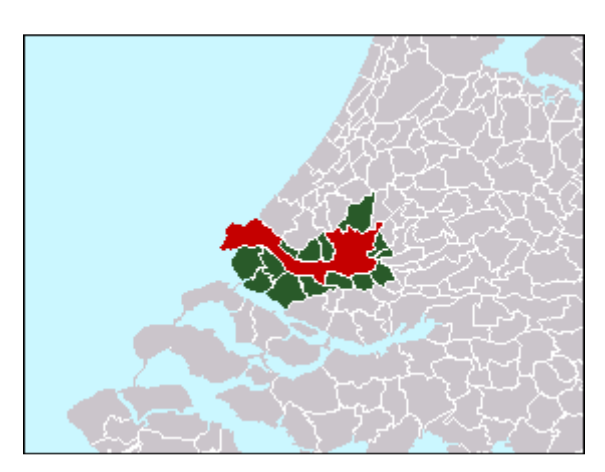
Figure 1: Area of interest: Rotterdam, city (red); excluded: Rotterdam, region (green)

Assumptions on the fleet composition and traffic statistics are specified for the Rotterdam situation. Only if no specific data is available, Dutch average numbers are used, e.g. for the average fuel consumption of vehicles. The scope of this study is to provide an order-of-magnitude estimate of the annual associated cost savings for Rotterdam if the entire fleet was to switch to Triple-A tyres and if the tyre pressure is to be maintained at the prescribed value. It is not a full-scale impact assessment, however gives an indication of the potential benefits of quality tyres on vehicles. The area of interest is depicted in red in Figure 1.