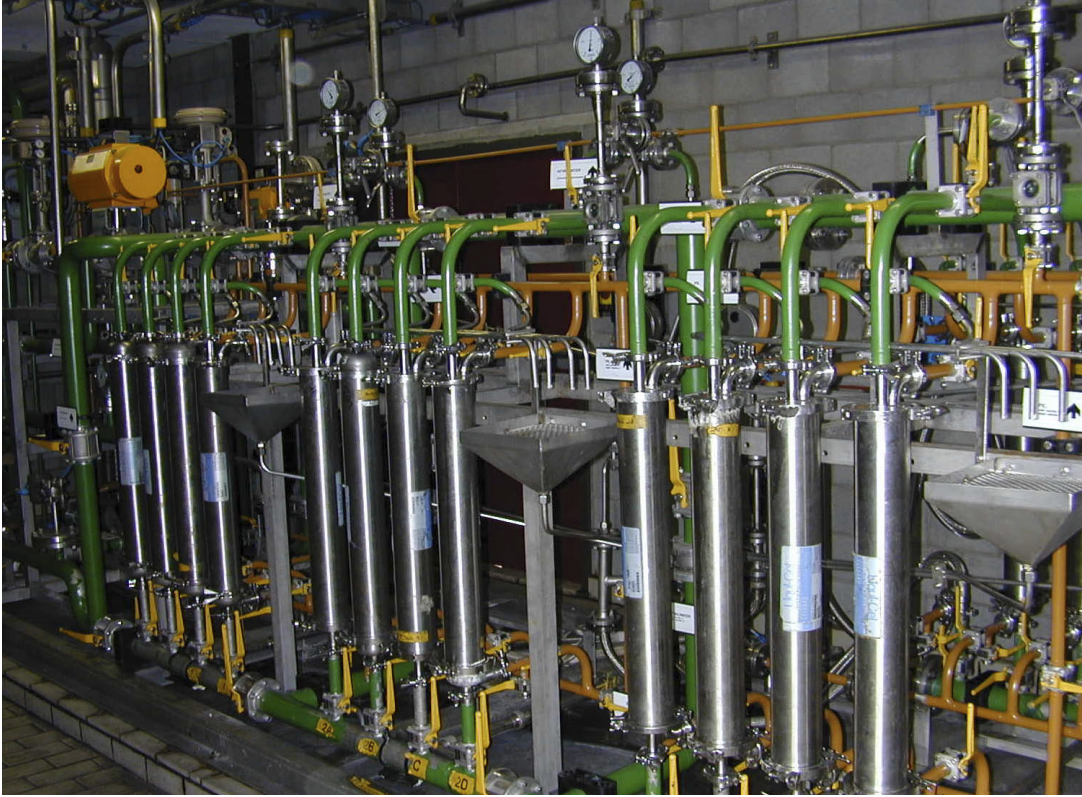
Industrial pertraction installation