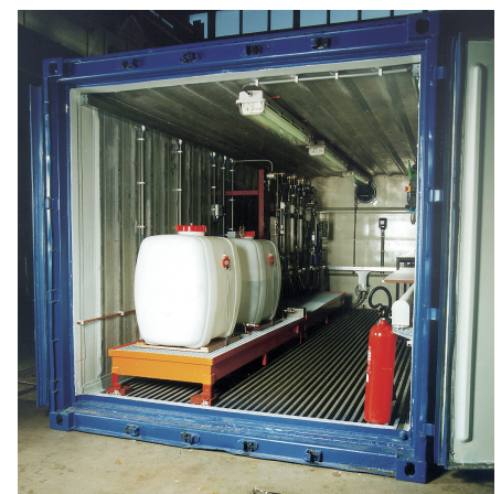
Mobile pertraction pilot plant ARKA

the waste water and the extractant. In the pertraction process, therefore, the extractant is not added directly to the waste water, as in a conventional extraction process. This offers important advantages over conventional extraction. It means that the often difficult and time