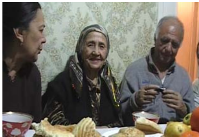
Fig. 3: Interview in Uzbekistan

When the student returns to Delft, the camera is handed over to the project team. The student makes an English translation and subtitles of the interview for the project team. The goal of this Flower is to make video clips in 10 countries. All clips will be placed on a designated website. So far, the project has yielded interviews in the following countries: Ethiopia, China, Nigeria, Poland, Spain, Sweden and Uzbekistan. Fig. 3 shows a screen shot from the interview conducted in Uzbekistan.