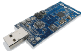
Fig. 2: A sensor node

technology and the desire of the applications. Therefore, we want to collect the opinions of people from every corner of the world. This way telecommunication students learn to acknowledge diverse opinions on new technology and engineer solutions that meet people's needs. Whenever PhD or MSc students return to their home country, they conduct interviews with a (grand) parent (or a member of another generation than their own) and tape this with a video camera. Interviews are conducted in the mother tongue of the student. The interview starts with a few general questions about education. Examples questions are "What kind of education did you receive?" and "What educational means were used?". The interview proceeds with a few general questions about ICT, for instance "Do you frequently use computers?" and "Do you have a mobile phone?". The final part of the interview focuses on sensor nodes. The student shows a sensor node, see Fig. 2, to the (grand)parent and asks, amongst others, "What do you think this is?" and "How much do you think the device costs?".