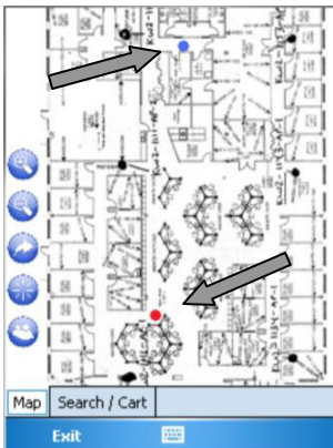
Figure 1. Auto-zoom feature. The red dot* (lower) denotes user's current location and the blue dot* (top) denotes user's destination.

Path Visualization (+, +/-, -): The fastest or shortest route is indicated as a colored line between user's location and destination. This route automatically updates as users change their location, resulting in less navigational and mental strain on the user. The user can also manipulate the route in the display.