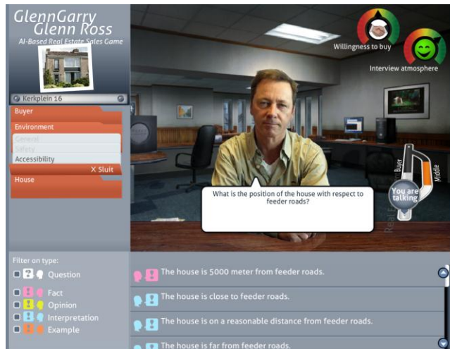
Figure 3. The GUI of the real-estate sales game

Figure 3 shows the GUI designed for the sales game. The center of the screen shows the buyer agent; its utterances are presented in a text balloon below it. The turn taking mechanism is shown on the right. The blue sphere represents who has the turn. It is located at the orange middle when the turn is available – the player can request the turn by dragging the sphere towards him. In the upper right corner two indicators represent the current states of