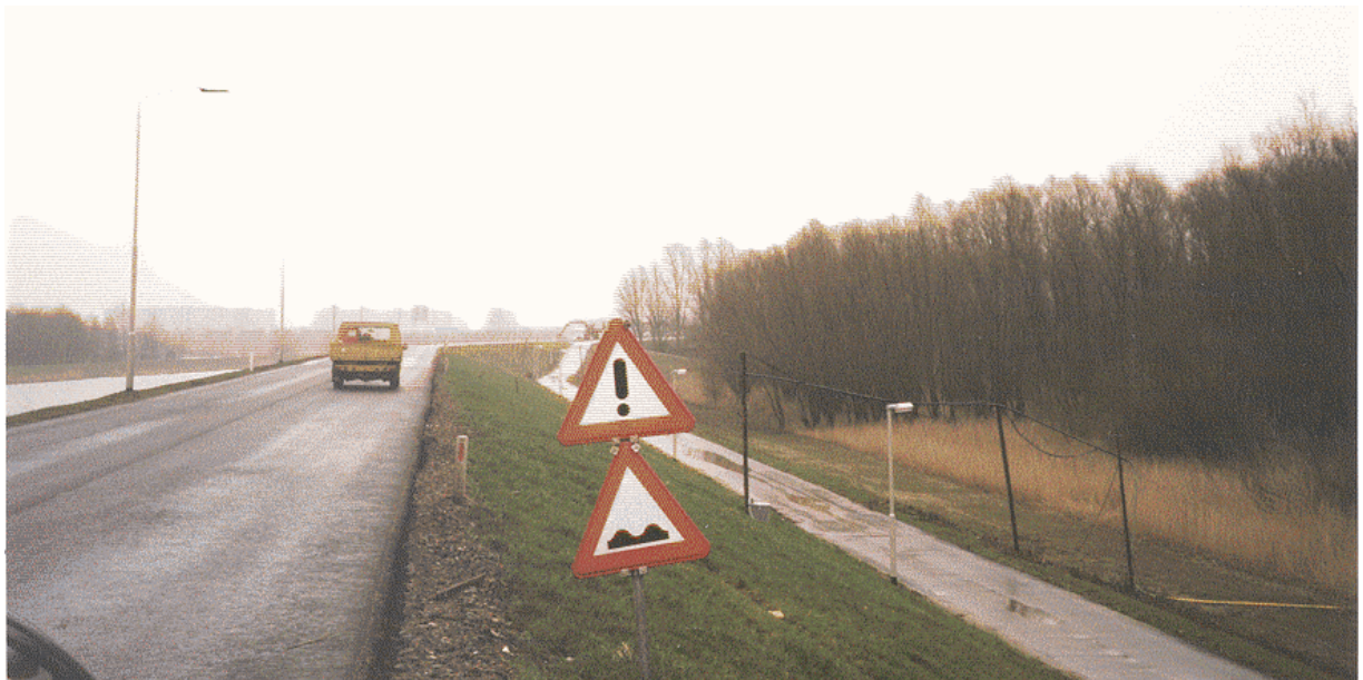
Figure 1. River dike near Gorinchem. Bumpy road caused by deformations.

A river dike near Gorinchem (The Netherlands) was selected as the main target of the measurements. (Fig.1).